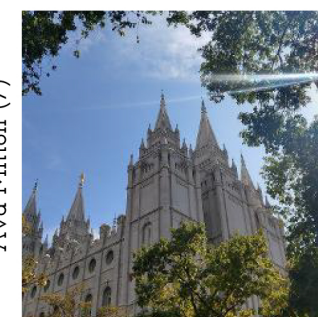
Ava Mitton (7)

"I love photography because there are endless possibilities of pictures at your fingertips. You can go anywhere and do anything you want and still get cool photos. Photography put my mind to work trying to find creative ways to make something look cool, and I love creativity. Having a camera or phone in your hands sets you free to do anything!"